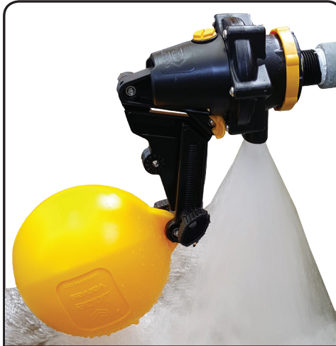
Topaz Valve Only