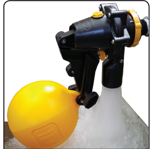
Topaz Valve with Outlet Extension